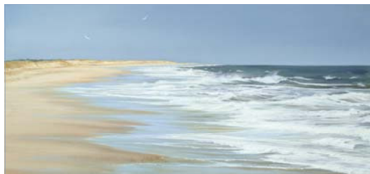
"The Cove," shown nearing completion.

I haven't done Remarque paintings in almost a decade because they take so much time. With time constraints in mind, these will be special orders and I'll probably only be able to do one or two before the holidays.