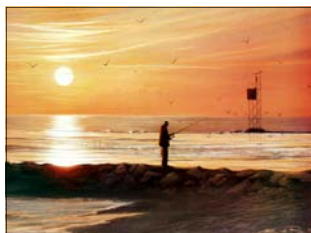
Three of Ellen's most popular paintings are going to debut as museum framed nightlights at the tour. Gift boxed for $29.95.