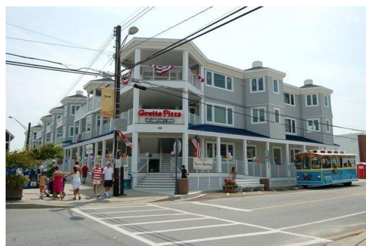
The Blue Surf Condominiums and Shops building where we just relocated, ocean block, Bethany Beach.

For the summer, our hours are 10 a.m. to 10 p.m., in one of the most lovely beach towns in the United States. See you soon!